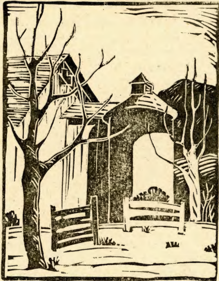
TREES AND FARM BUILDINGS

What must visitors think of the students, more especially the girls, when they see lip prints on walls in the dorms or on a curtain in the ad building? Well, they probably don't get a very good impression. Here again school spirit comes into the picture because if one respects her school, she won't do something that will leave a bad impression